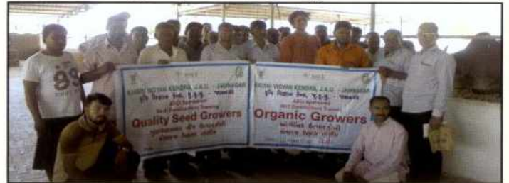
Banshi Gir Gaushala, Ahmedabad Visit

Agriculture Skill Council of India has sanctioned two training for 200 hours for 20 farmers each on “Organic Growers” and on “Quality Seed Growers” at Krishi Vigyan Kendra, JAU, Jamnagar. Both the trainings for 40 farmers were arranged along with exposure visit to different farmers who are organic grower and quality seed producer and marketing their products themselves was also arranged by KVK, Jamnagar.