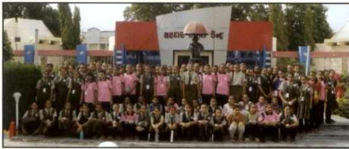
Students of Shri Sardar Patel Primary School, Junagadh visited our SSK