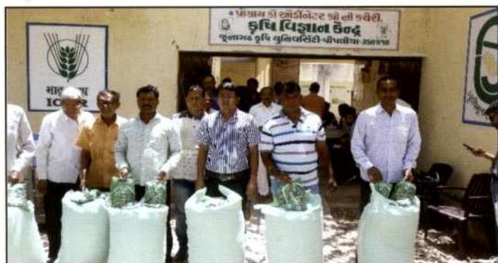
FLD on IDM in Groundnut

One Front line demonstration (FLD), one Cluster Front line Demonstration (CFLD) under different scientific practices like; IDM, IPM and Varietal demonstration of Groundnut in 62-hectare area (155 beneficiaries) was conducted. FLD on IPM in cotton covered 8 hectares and 20 beneficiaries. FLD on Kitchen Gardening of six different vegetables were organized covering 0.5 ha. area and 50 beneficiaries from different villages under KVK Pipalia.