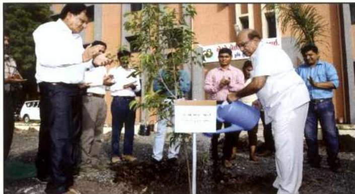
Tree plantation at Agro based ITI, JAU, Junagadh