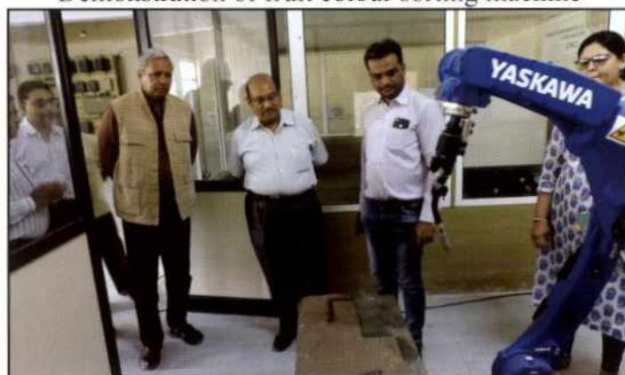
Demonstration of Welding Robots