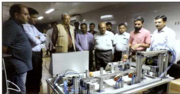
Demonstration of fruit colour sorting machine