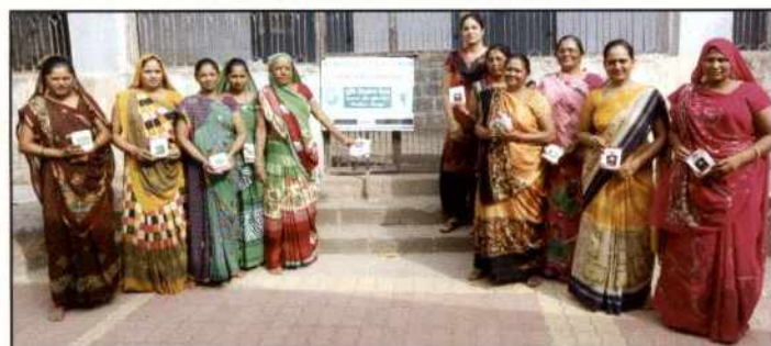
FLD on Kitchen Gardening