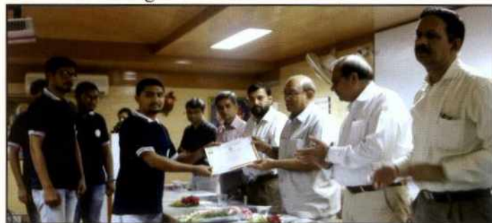
Distribution of Life Membership certificates of CAET Alumni Association