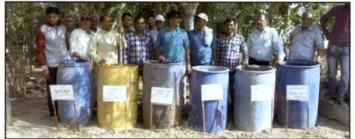
Visit of Ramkrishna Trust, Kukma