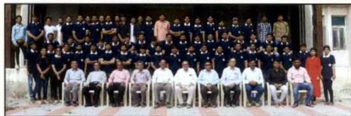
B. Tech. (Agril. Engg.) Outgoing Batch-2019